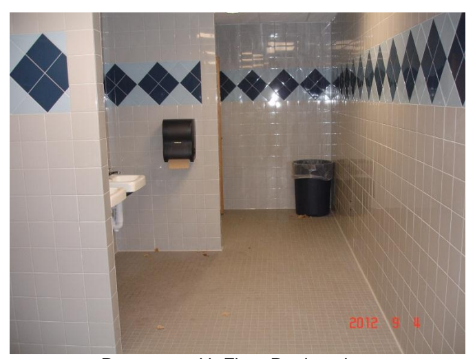
Restroom with Floor Replaced