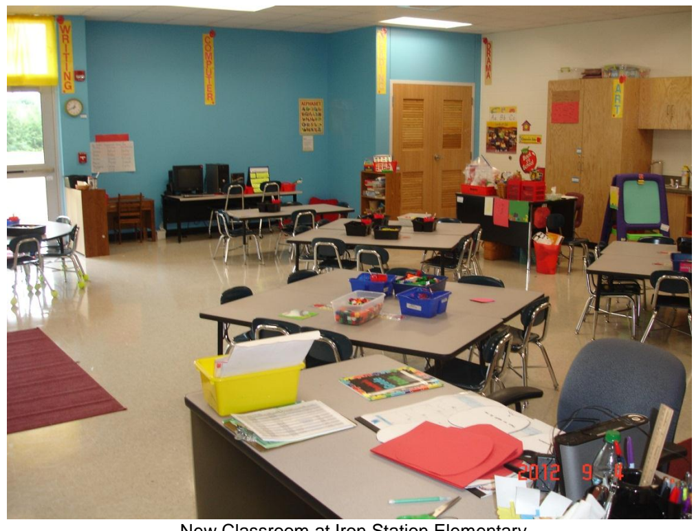
New Classroom at Iron Station Elementary