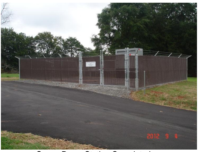
Sewer Pump Station Completed