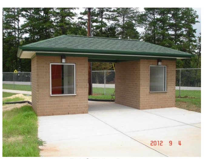
ELHS Ticket Booth